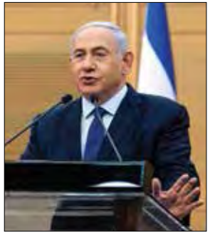
Israeli Prime Minister Benjamin Netanyahu speaks to the Israeli Parliament in Jerusalem, Sunday

Getting unseated from premiership at this juncture would be a huge blow for Netanyahu, popularly nicknamed Bibi, as his trial for bribery, fraud and breach of trust picks up steam in Jerusalem's District Court.