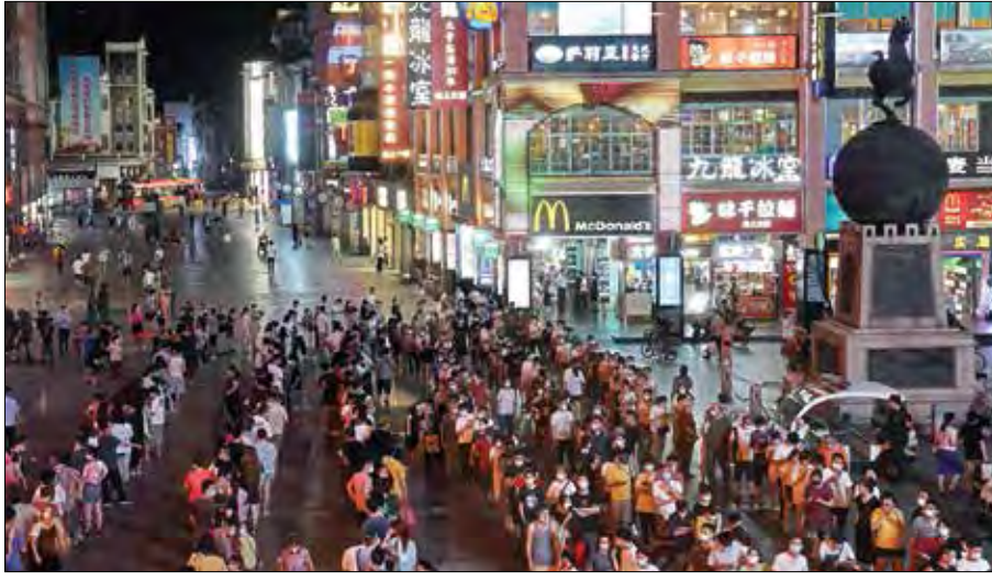
Residents line up for Coronavirus testing in the Liwan District in Guangzhou in southern China's Guangdong province

The new census figures revealed that the demographic crisis China faced was expected to deepen as the population above 60 years grew to 264 million, up by 18.7 per cent last year. As the calls for the government to do away with the family planning restrictions grew louder due to the con-